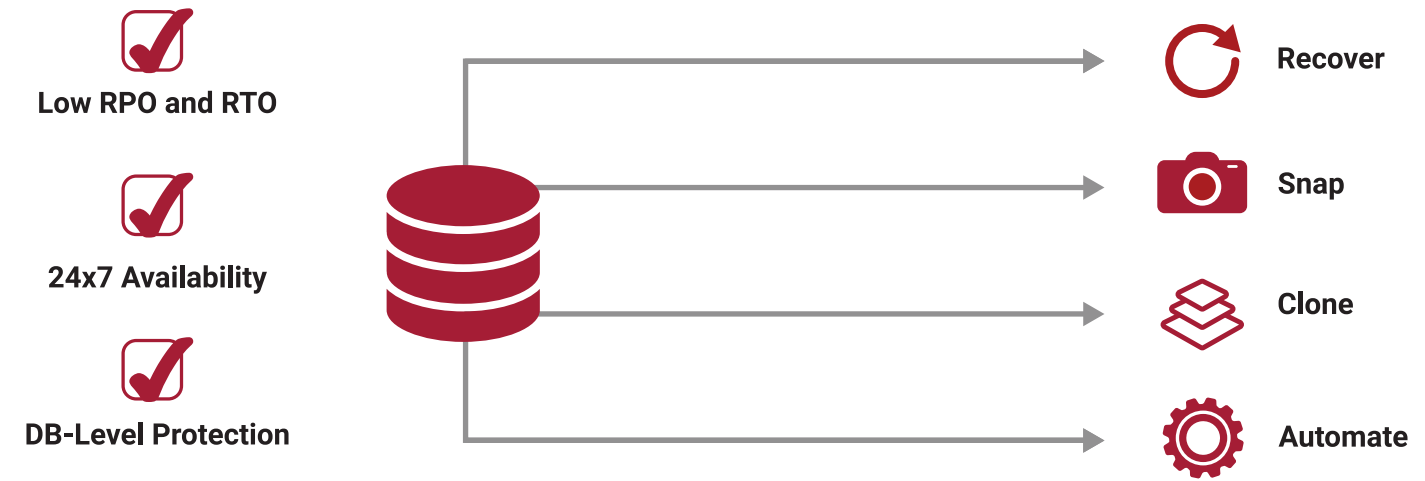
Figure 3 – Protect your SQL Server databases with policies at DB level

Most DBAs are not storage experts; they speak in terms of recovery point objective (RPO), and recovery time objective (RTO) as they are accountable for these metrics down to the second. DBAs often find conventional storage i.e., standard infrastructure based on LUNs, overly complex to manage, which adds additional risk of human error potentially risking business continuity. Standard infrastructure requires constant tuning and becomes obsolete quickly as business needs change. VMstore eliminates storage complexity, helping DBAs to achieve low RPOs and RTOs with database level snapshots with zero stun, non-disruptive clones, and synchronous replication.