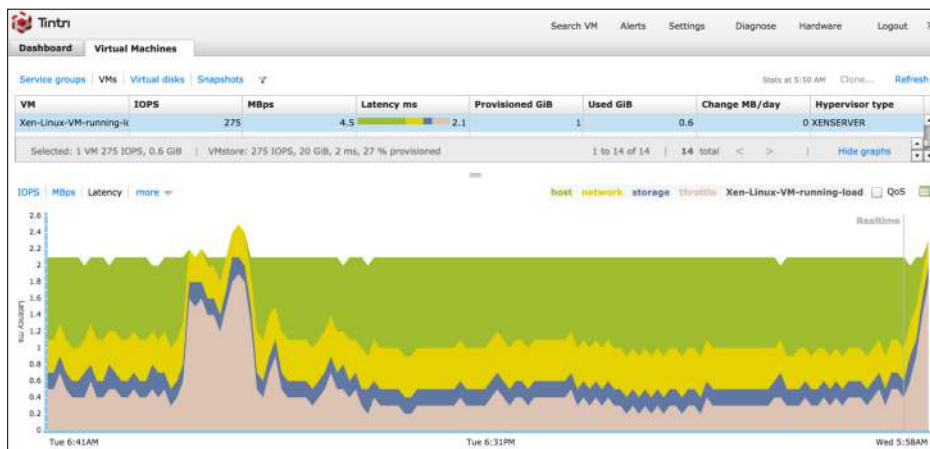
Figure 1 VM-level Visibility with Latency Across Infrastructures

Since performance isolation is performed down to an individual VM level, Tintri can guarantee quality of service (QoS) with no spillover to other VMs. For details, refer to the QoS for Tintri VMstore white paper. You can monitor real-time analytics and collect historical statistics about your XenServer VMs running on Tintri VMstore. Figure 1 shows VM-level visibility with latency across host, network, storage and throttle.