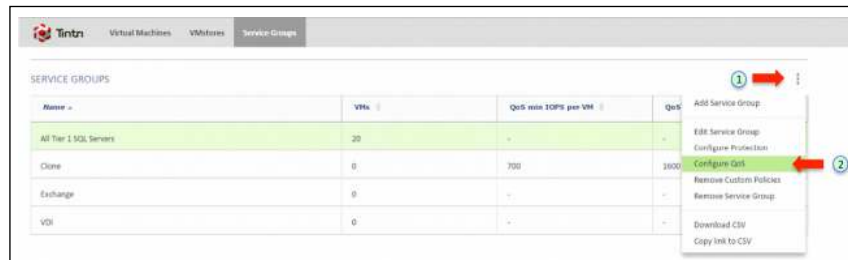
Figure 3. Ease of configuring QoS on a service group level

Simple, automated management across the infrastructure results in 98% reduction in mundane tasks, allowing CSPs to focus on services that generate revenue and significantly reduce OpEx.