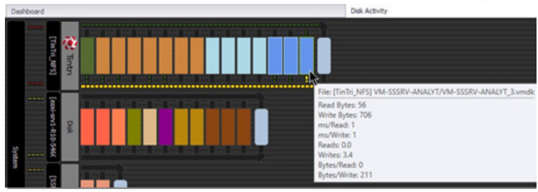
Figure 1 – Virtual datastore disk activity in SQLSentry dashboard

SQLSentry empowers Microsoft data professionals to achieve breakthrough performance across physical, virtual, and cloud environments. SQLSentry enables you to confidently diagnose the root cause of performance issues and optimize your entire server environment for peak performance, regardless of size or complexity.